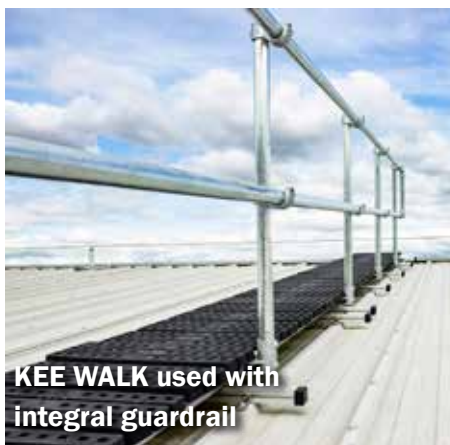
KEE WALK used with integral guardrail