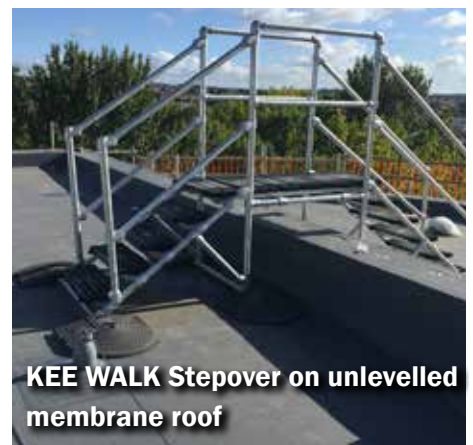
KEE WALK Stepover on unlevelled membrane roof