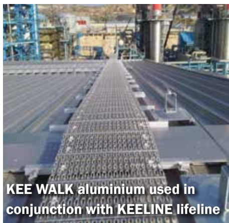
KEE WALK aluminium used in conjunction with KEELINE lifeline

Can be used in conjunction with others products to provide a complete fall protection plan.